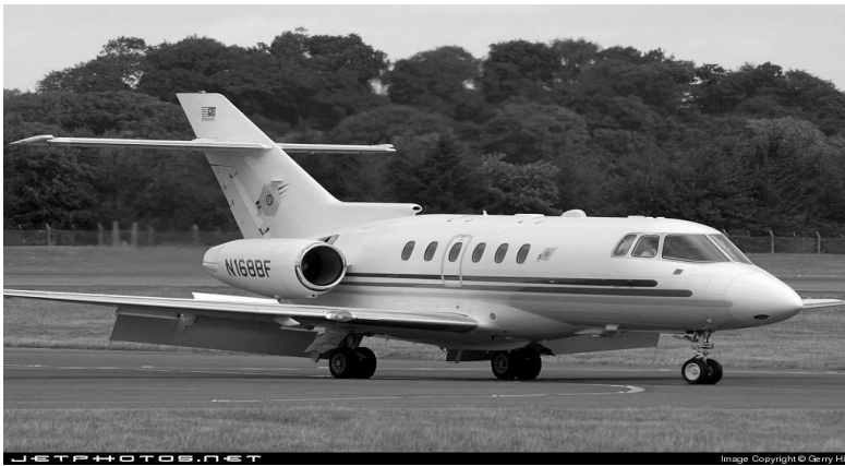
At Edinburgh Airport

Aircraft: Raytheon Hawker 800XP S/Number: 258373 N/Number: N168BF Dates/Airports: 25.08.2005 Edinburgh