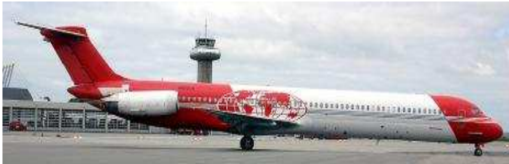
By: Jan-Petter Helgesen 9

Aircraft: McDonnell Douglas MD82 S/Number: 49139 N/Number: N822US 6 Dates/Airports: 08.12.2002-Glasgow, 26.08.2003-Prestwick 7 8