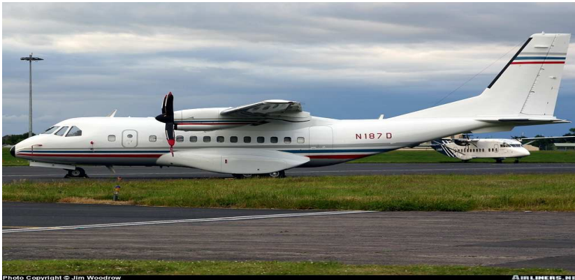
Aircraft at Edinburgh en-route to the US from Seville

Aircraft: CASA S/Number: C-143 N/Number: N187D Dates/Airports: 20.06.2005 Edinburgh