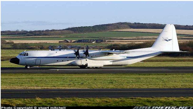
Taken at Prestwick Airport on 13.11.2004

Aircraft: Lockheed Herc. 382G-44K-30 (L100-30) S/Number: 4796 N/Number: N8183J Dates/Airports: 13.11.2004 Prestwick